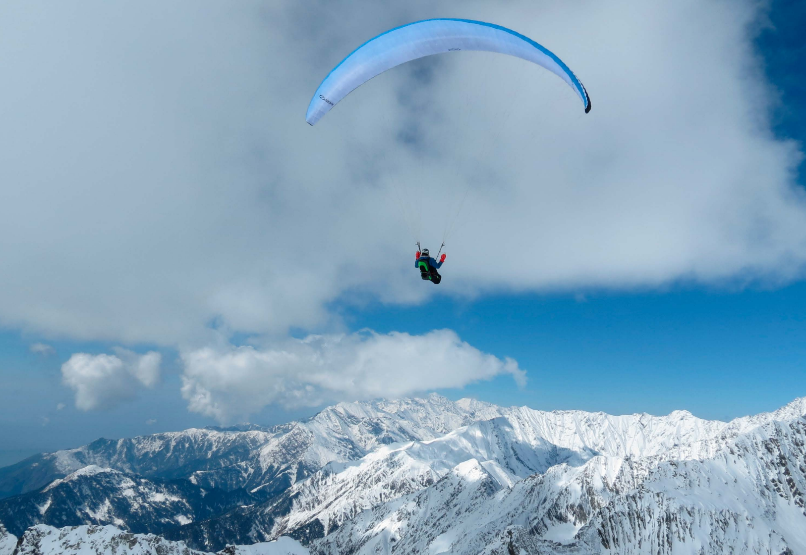
Epic mountain flying.