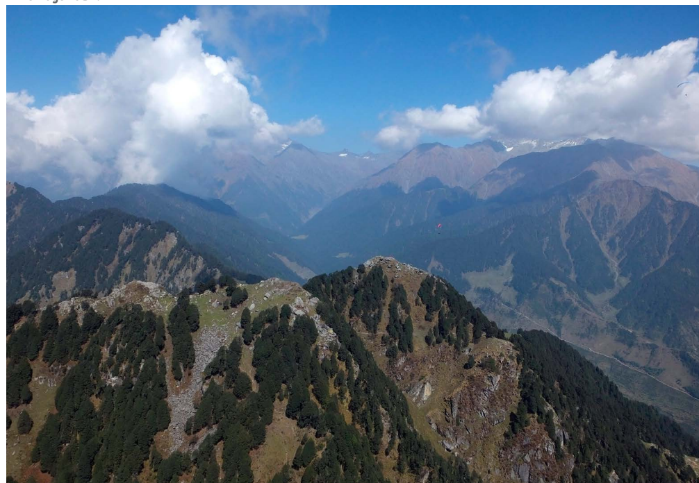
The ridge at Bir.