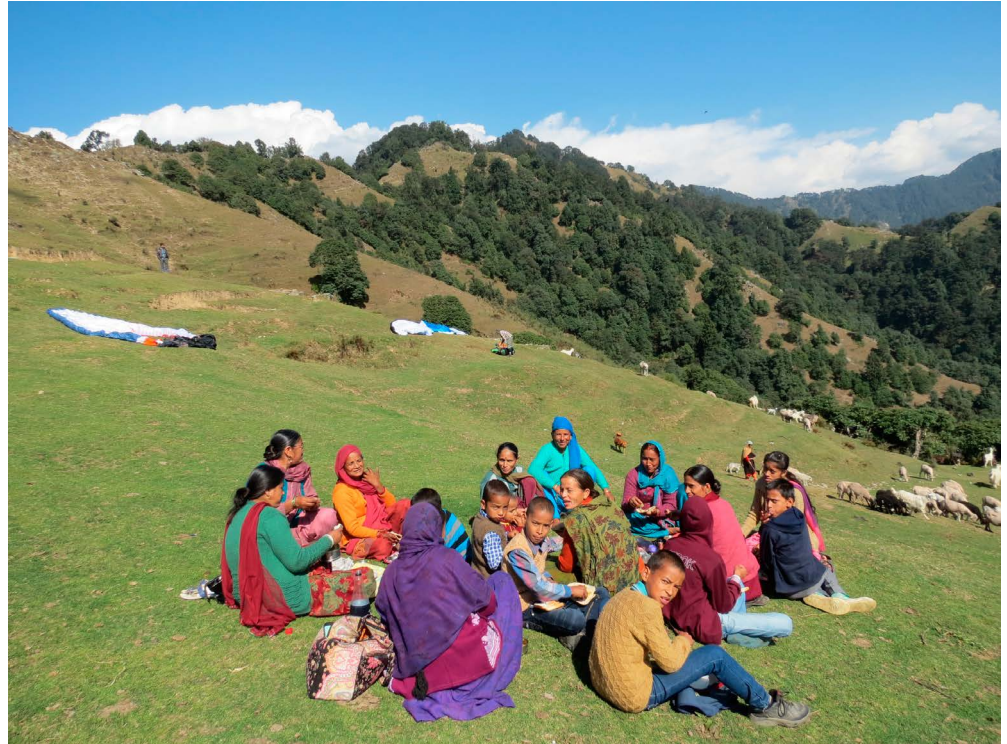
A group of spectators at launch

A tree rescue can be hugely epic as, even on the front ridge, you might be hours from a road and the slopes and trees are tall/steep enough that you're hugely high up. And that's without the bears and leopards... A ball of dental floss can be a useful lightweight aid to haul up a rescue rope. Anyway it's really not necessary to surf the trees that close, possibly excepting late in the day on your return from your adventures.