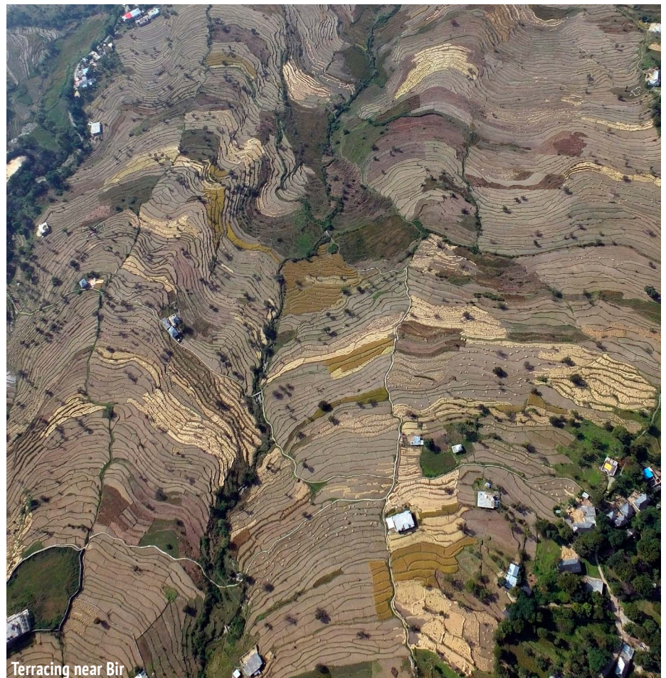
Terracing near Bir