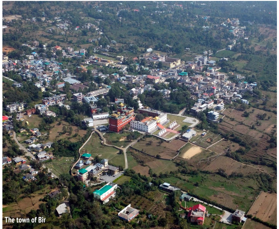
The town of Bir

There are also Nam Langs, Hotel Soraya, Gurpreet's hotel near the landing field, Poldines by the Garden Cafe, Sian's Place and many other Buddhist owned guest houses/hotels within the Colony. The prices can vary from $8 - $50 per/night and a meal from $2 - $20. They have been building a hotel on launch for the last few years. Maybe it's ready now. It would be a tremendous place to wake up.