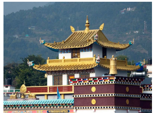
A temple in Bir.