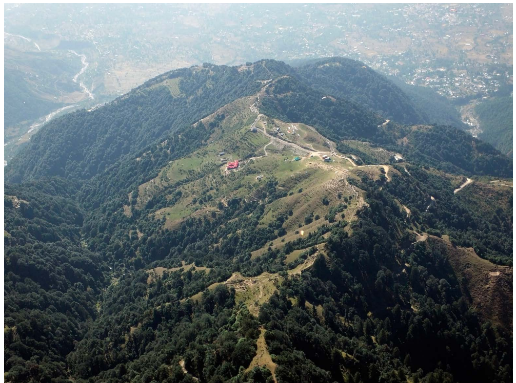
The take-off at Billing