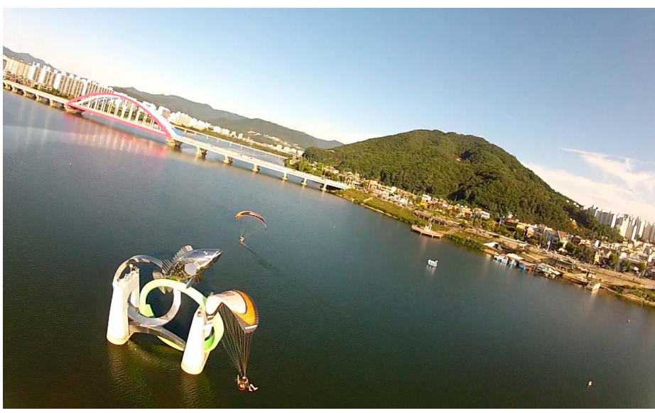
Chuncheon is a town full of bizarre, brightly coloured modern art.

For more information: www.wearetheroversfilm.com