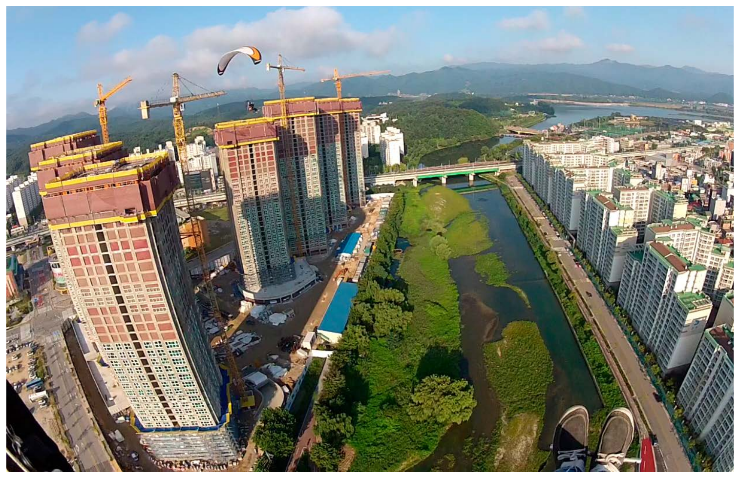
And yes, the arms on all those cranes are moving!

These same buildings generate turbulence, as treacherous as it is invisible. Trees, posts, cars, buses, lorries, notice boards, trams, cows, calves and pigs all need to be avoided. It may be nice in the air but, it is war on the ground.