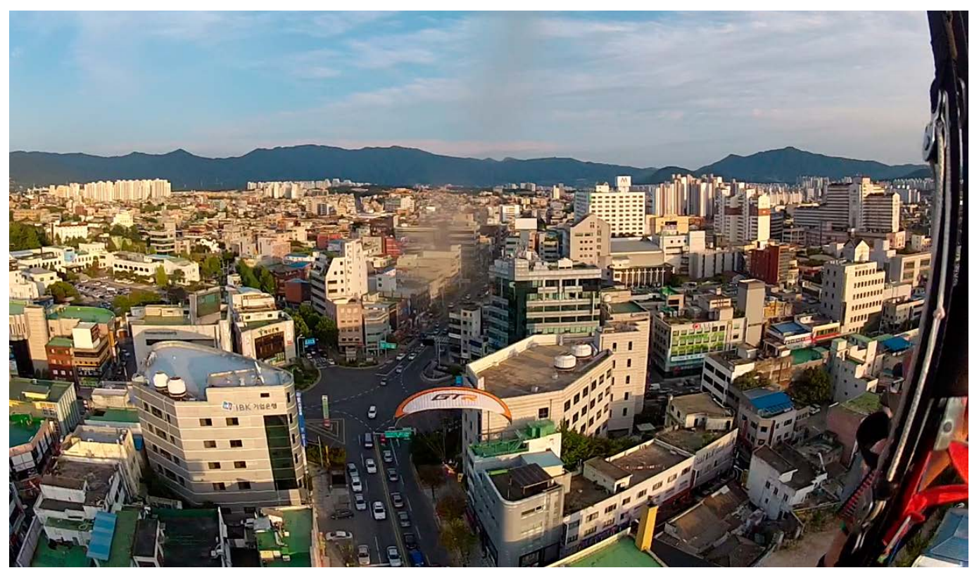
Off for a spot of window shopping in downtown Chuncheon.

Korea was going to be a far cry from the setting for the last episode, Scotland, with its wild rugged landscapes. We would be flying in a raw urban setting where, luckily, paramotoring is more or less tolerated.