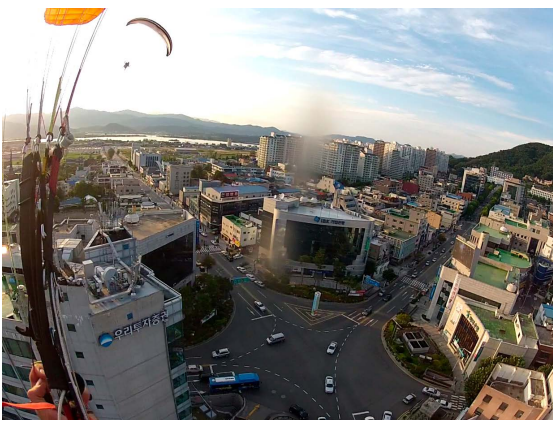
A lot more exciting than a video game!

Below it is hell! We fly between two ten storey high tower blocks, through a gap of just 30 m. As if in a high-speed chase we slalom into the bend dodging telephone aerials.