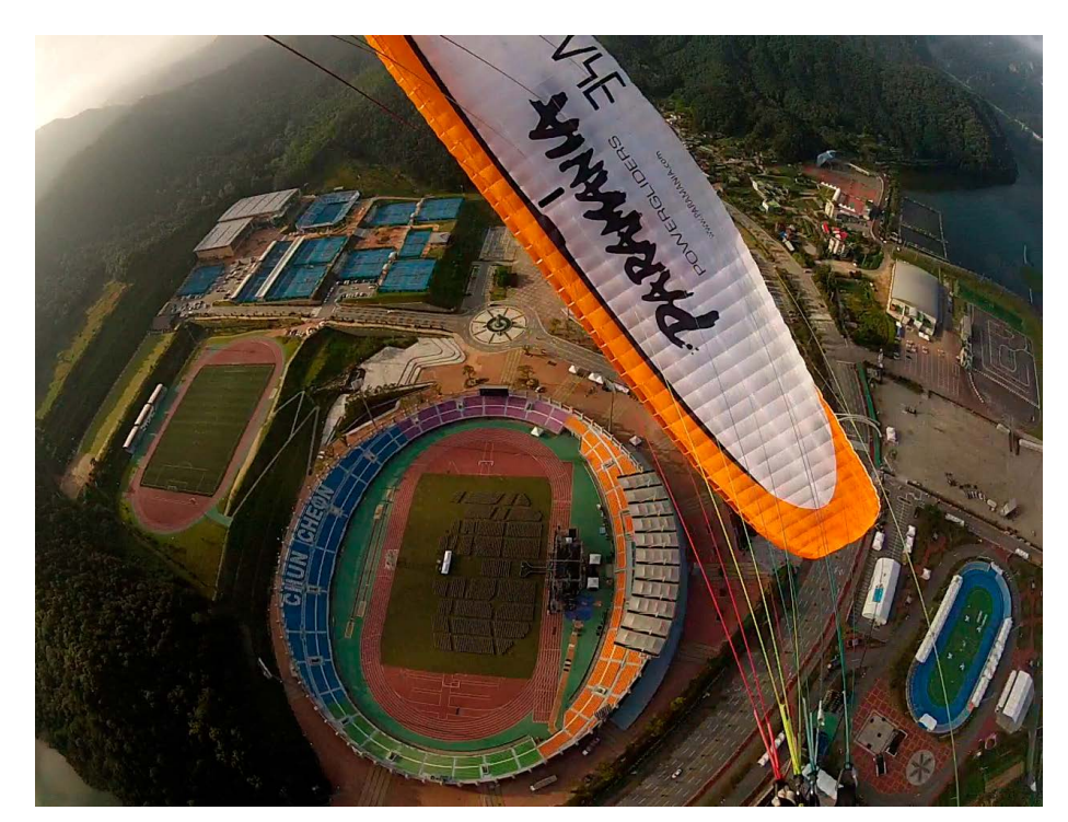
The town's massive sports stadium.