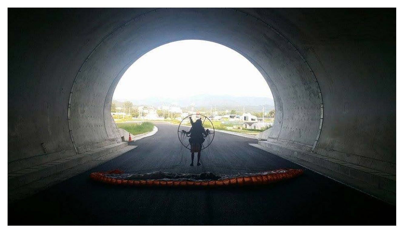
Please don't try doing this on the M25.

year ago we travelled to Scotland to film the first episode in a series of films called, 'We Are The Rovers'. The concept is simple: a group of French and English speaking paramotoring friends with, as a common language, a lot of franglais on the tip of our tongues. Our goal: human adventures, cultural discoveries, and lots more... So plane tickets packed, a cameraman in tow and off we go... half way round the world to Korea.