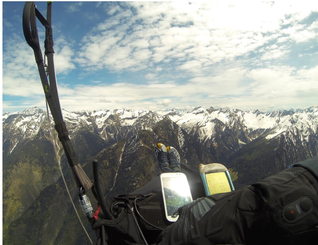
Keen on big Air!

Then I blew my condom catheter off and peed all over my gear and instruments and eventually somehow even my face. Then I decided to try to turn around and head back over the Furka as some pilots seemed to be doing but when I tried to pee again hanging out of my harness I managed to pee once again all over my face and I thought "ok fuck this, I'm just going to go downwind and land!". But I hate landing so I just put up with being wet and carried on. eventually landing near Zurich. Radical (albeit wet) flying!