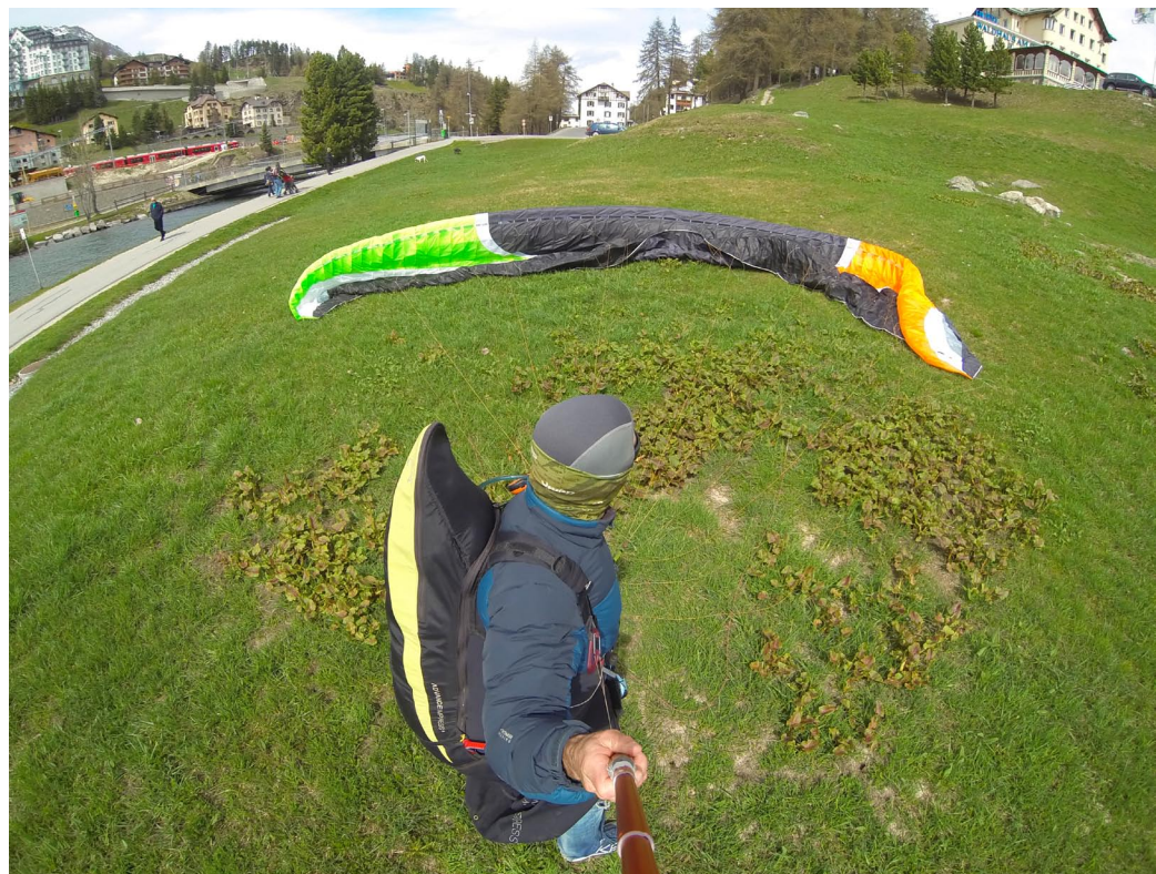
Landing at the Train Station!

As always, my time in Europe came to an end too early. But it was a successful run. 12 flights in 21 days. 69 hours in the air. Nearly 1300 KM. A solid warm-up to the season, and an astounding improvement on last year's 5 flights in the month of May. ■