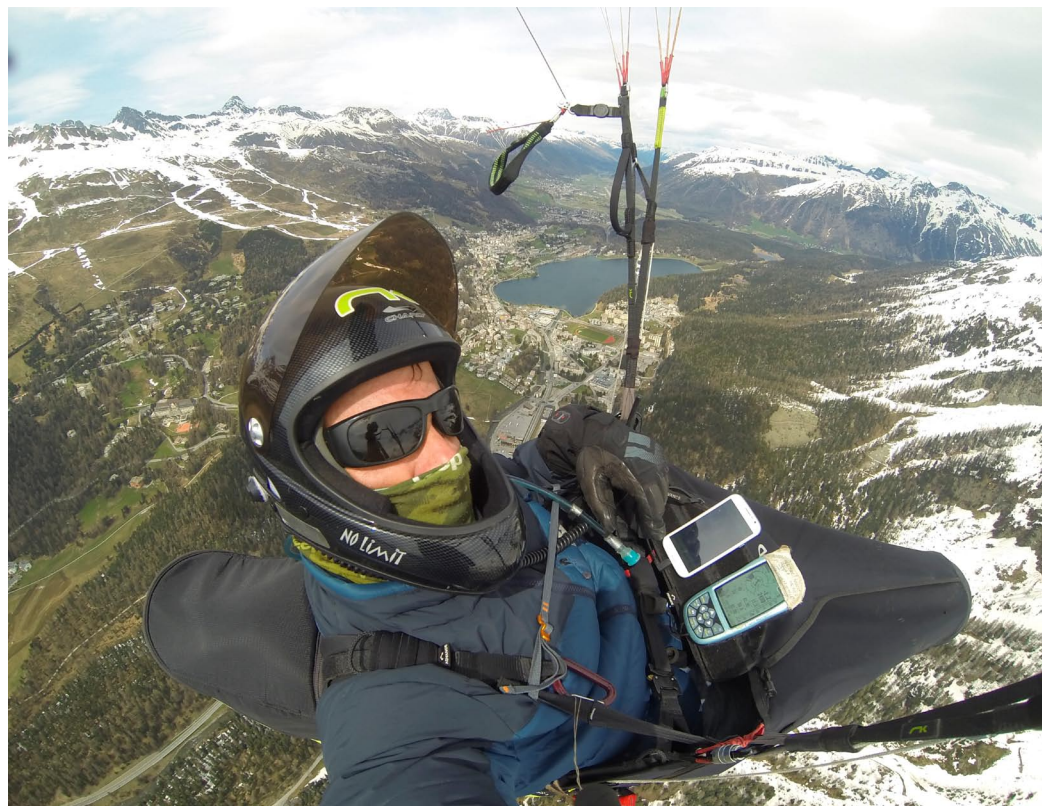
Flying into St Moritz