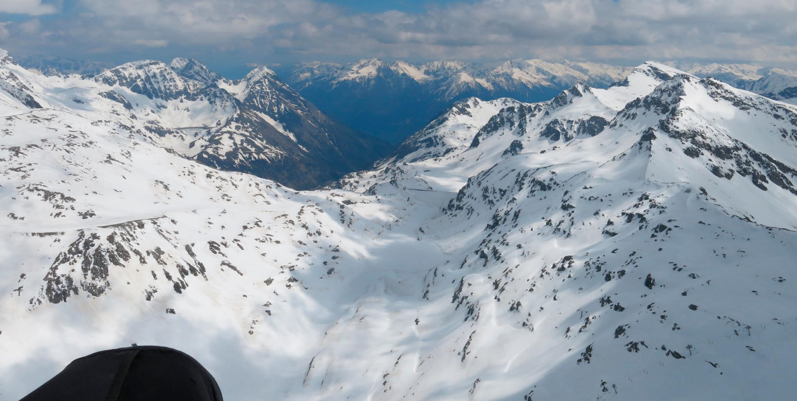
Heading over to the Pinzgau

From the Wallis we headed east again to Austria to try our luck at Greifenburg, one of the most famous flying sites in the Alps, and certainly THE most for Hangies. The line possibilities from Greifenburg are nearly endless and I made up my mind to try to be creative. We got three solid flights from Emberger Alm, the main launch, racking up a 152 free flight where I tried to do a huge FAI across into the Pinzgau in a strong south Foehn and couldn't get back; an 88 km flight to the stunning Gloscockner on a remarkably questionable day; and a beautiful if hard-fought 164 FAI where I tried to dismiss the standard routes and just fly hard terrain.