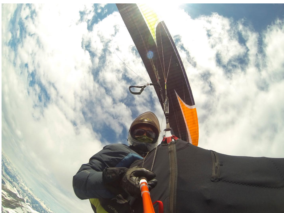
Getting into the groove in Bellazona on the Niviuk Peak 3