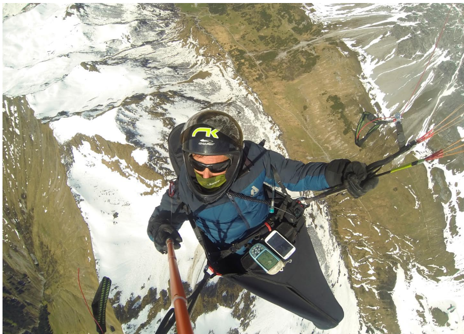
The Tour Begins up high in Fanas

My summer is stacked with paragliding plans which I'm trying to orient around training for next year's Red Bull X-Alps. I want to spend as much time as possible on the X-Alps route between Salzburg and Monaco pushing deep lines and hopping over cols and summits that demand some pretty attentive flying. Typically Bruce and I attempt FAI and Flat Triangles on proven routes that can easily be found on the X-Contest database and I'm an admitted kilometer chaser, but my mission this spring was to fly creative lines that would connect valley systems that pilots like Chrigel have mastered. And as Bruce will be one of my supporters next year, we also wanted to fly a lot of areas we are not yet familiar with. We foreigners are handicapped big time with the lack of local knowledge. For the Euros the Alps is their back yard and while I believe firmly that flying the Intermountain West is a lot more committing and a great training ground, the Alps reign supreme in its complexity.